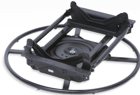
1010 (left), 1010 with swivel (right)